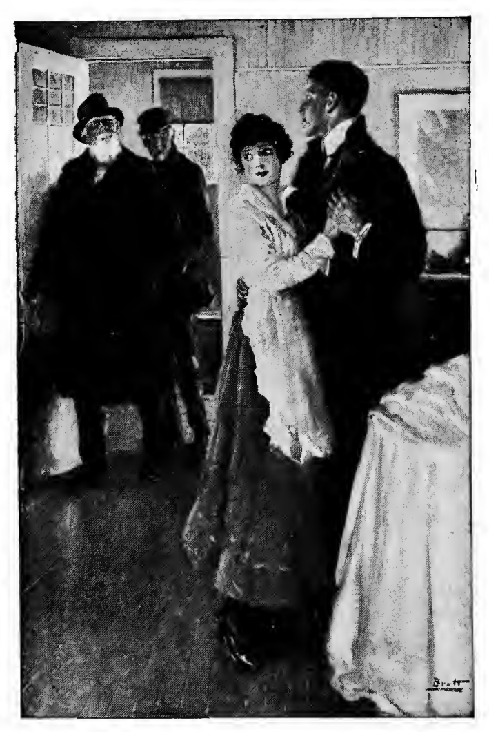
"There he stood stock still, staring" [PAGE 398.]